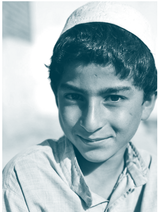
Less than 10% of the money Congress appropriated for Afghanistan in 2010 went to programs that educate children and bring greater peace and stability.

Thirteen Republicans joined Democrats to pass the first major nuclear arms treaty in decades. New START requires the U.S. and Russia, the owners of 95% of the world's nuclear weapons, to reduce their strategic deployed nuclear weapons arsenals to 1,550. The ratification of this treaty begins to restore U.S. credibility and sets the stage for pursuing other critical steps toward a nuclear weapons free world. Passed, 71-26.